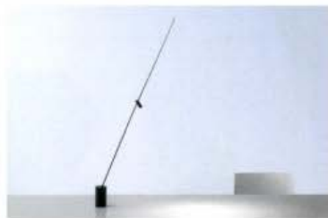
DAVIDE GROPPI SRL

Another variation on Groppi's reed-thin, antenna-style fittings, FM is a table fitting with microswitch dimmer. Powered by warm white 2W LED - 2700K (130 lm) or 3000K (140 lm), both CRI 90 - the lamp uses Extradark technology to reduce the lighting aperture to near invisibility. davidegropi.com