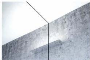
DAVIDE GROPPI SRL

The latest from the master of the minimal, Reflex is an indirect wall and ceiling lamp. Measuring 650mm x 152mm x 4mm, it is effectively a powerful LED and an ultra-thin mirror. Designed to be powered with the company's patented Endless system - adhesive conductive tape that can be applied to any surface - it can also be installed without. The mirror allows the lamp to be camouflaged while providing unusual perspectives and illusions of light. davidegropi.com